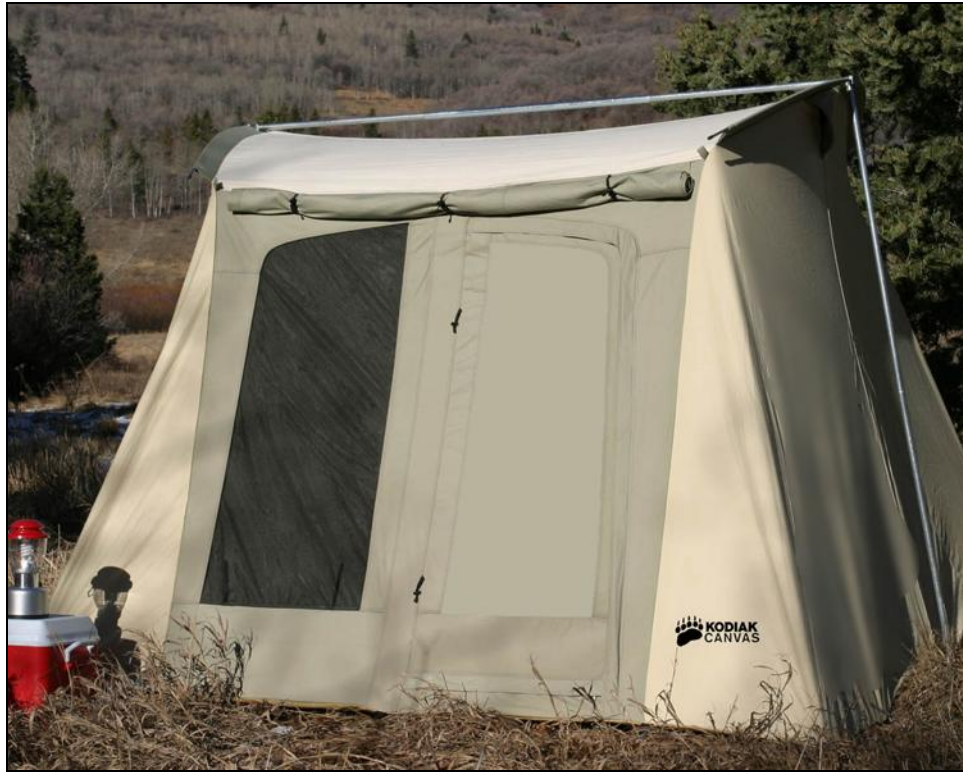
6- Person 10x10' (Model 6055)

Just because your camping doesn't mean you have to rough it. This rugged tent is built to stand up to Mother Nature's worst. The design, materials, and workmanship make it one of the most durable long-lasting tents available. Our tents are unbeatable for comfort and convenience. If you are serious about the outdoors, it's time you have a serious tent.